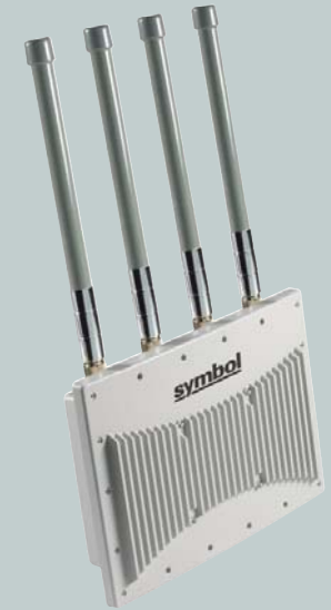
Shown with optional antennas.

Using its mesh capability, the dual-radio AP-5181 can connect to other access points for data backhaul while providing network access to local users. Enabling an array of applications, from simple point-to-point bridges connecting two wired networks to complex multi-node, multi-link networks, this feature offers a simple way to extend the network to outdoor or remote locations. The self-assembling and self-healing aspects of a mesh network make the network flexible and easy to manage. This, combined with the straightforward configuration interface, makes deploying and maintaining a secure wireless network of access points almost effortless.