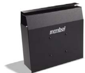
Heavy Weather Kit KT-5181-HW-01R