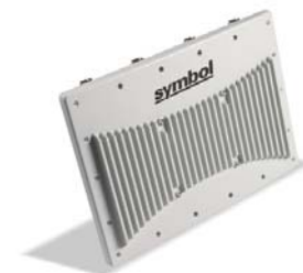
AP-5181 Dual Radio AP AP-5181-13040-WWR