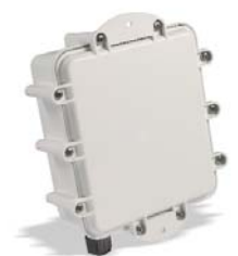
48V Transformer and Power Surge Protector AP-PSBIAS-5181-01R