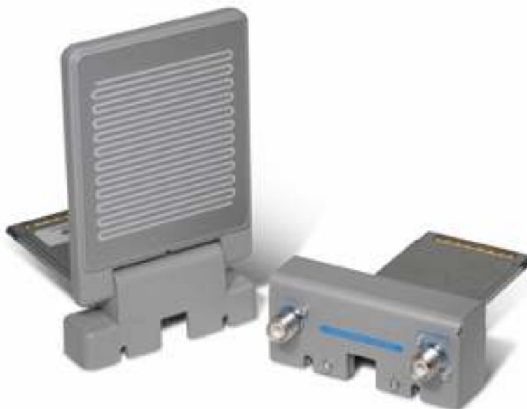
Figure 1. Cisco Aironet 1200 Series Access Points 802.11a Radio Modules

All available radios (802.11a, 802.11b, and 802.11g) provide a variety of transmit power settings to adjust coverage area size. To extend the flexibility of deployments, the 802.11a radio module is available in two versions (Figure 1). Both versions provide up to 12 nonoverlapping channels in the 5 GHz band (subject to local regulations); an additional 11 will become available in 2005 with a field firmware upgrade. One version offers dual antenna connectors for use with a wide variety of Cisco antennas to achieve extended range and application-specific coverage. The second has an integrated antenna design that incorporates diversity omnidirectional (5 dBi) and patch antennas (9 dBi). For ceiling, desktop, or other horizontal installations, the integrated omnidirectional antenna provides an optimal coverage pattern and maximum range. For wall-mount installations, the patch antenna provides a hemispherical coverage pattern that uniformly directs the radio energy from the wall and across the room. Both the omnidirectional and patch antennas provide diversity for maximum reliability, even in high-multipath environments such as offices and other indoor environments. Coupled with the broadest selection of 2.4 GHz and 5 GHz antennas in the industry, this provides users with unparalleled flexibility in cell size and coverage patterns.